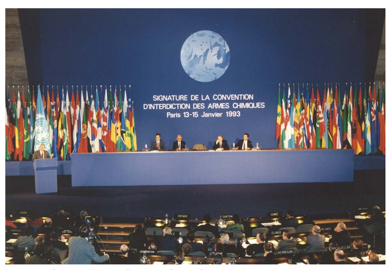
Chemical Weapons Convention Signing Ceremony, Paris, January 13, 1993